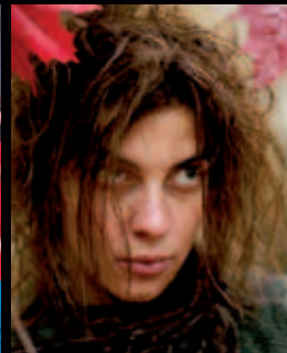
Natalia Tena Harry Potter