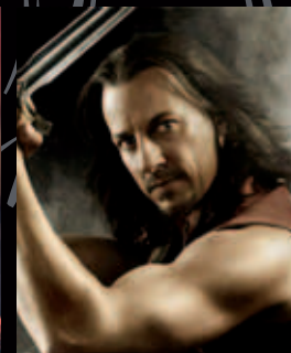
Craig Parker Legend of the Seeker • LoTR