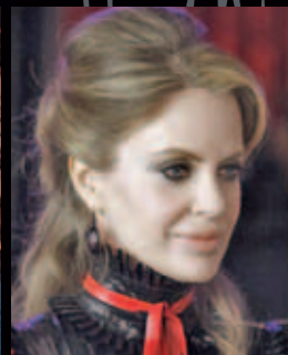
Kristin Bauer True Blood