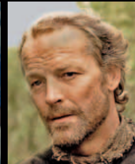
Iain Glen Game of Thrones