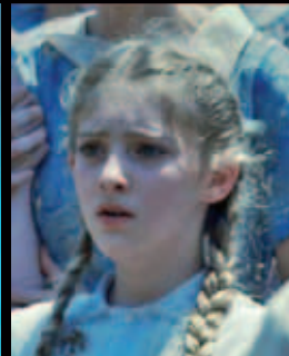
Willow Shields The Hunger Games